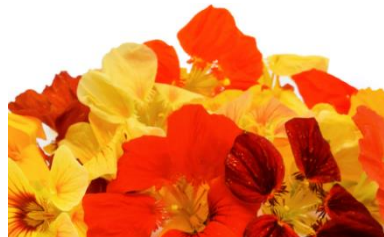
Nasturtium – Edible Flowers

I appreciate the April showers for at least two reasons. They provide water improving soil moisture to allowing for germination of seeds cast last year, and it also washes sand and salt off the roads making our riding safer and decreasing the amount of rust that is likely to form on our motorcycles and cars.